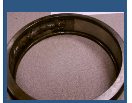
Outer race bearing defect of gear A bearing found through vibration analysis

Predictive maintenance extends the life of machinery, and saves money.